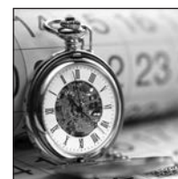
On the cover: