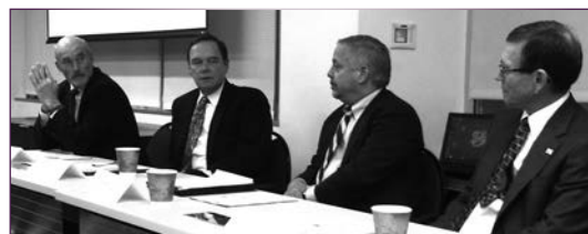
Panel discussion at American Farm Bureau Federation.