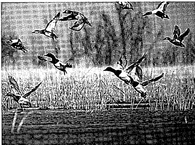
Figure 3.2. Canvasback ducks ( Aythya valisineria ) at Goose Lake, Greene County, Iowa.

Because the bid process was not competitive in the