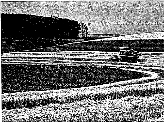
Figure 3.1. Strip crop wheat harvesting.

reported that guaranteed returns and high prices offered by CRP rentals played a major role in stabilizing and strengthening land values for landowners in the late 1980s. Shoemaker (1989) found land value increases of $62 to $132/a. in areas of high CRP enrollment.