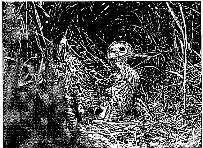
Figure 3.3. An upland sandpiper ( Bartramia longicauda ) returning to a nest containing four eggs in Ringgold County, Iowa. Upland sandpipers prefer to nest in mid- to tall-grasslands that are undisturbed, such as CRP acres.