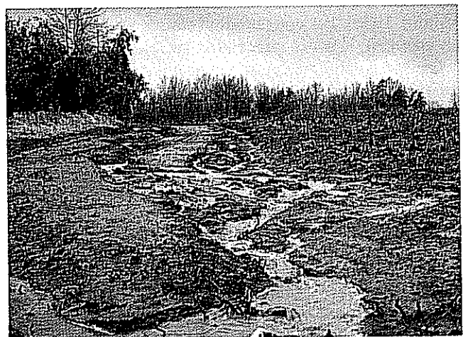
Figure 2.2. Farmland water erosion in North Carolina.