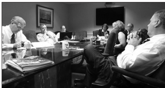
CAST Board of Directors' business meeting.