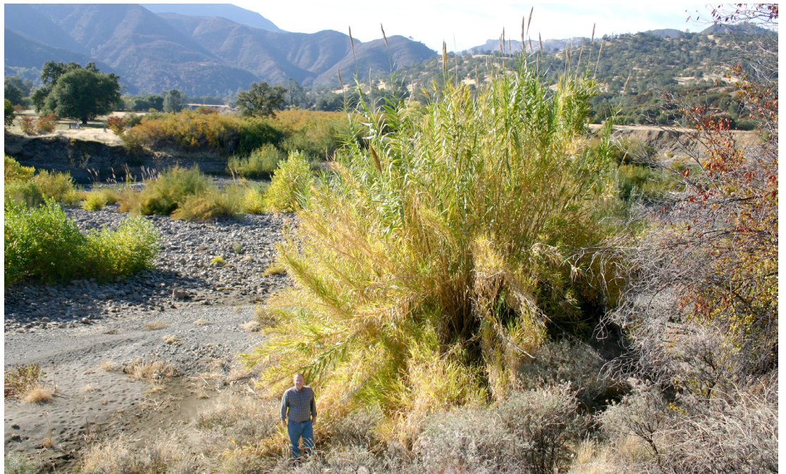
Figure 2. Giant reed ( Arundo donax ) can reach 30 feet in height.

taxon, however, because many important invasive species fail to produce fertile seed, yet they are able to colonize vast regions and inflict economic and ecological damage (e.g., giant reed: Arundo donax as shown in Figure 2).