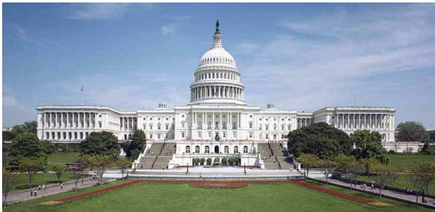
West view of the U.S. Capitol Building in Washington, D.C.