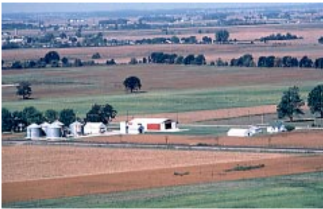
Figure S-4. Aerial view of many small farms in the midwestern United States.

Different forms of vertical coordination have different economic and social effects on communities, however. Marketing contracts tend not to displace resources from farms and small rural-communities but at the same time do not provide the economies of size or returns for explicit bundles of characteristics essential to the revitalization of local communities. Integrated ownership provides economies of size and scope but also has the potential to displace resources from traditional farms and rural communities because production units tend to be very large, and ownership and control may reside in distant metropolitan centers. A farming-dependent rural community may not be able to assemble locally the necessary venture capital, management, and other headquarters services for production units. Production con-