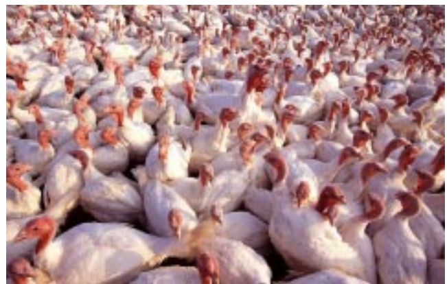
Figure S-7. Turkey production facility.

Production contracts and integrated ownership often can increase information flow and responsiveness, save inputs, improve productivity, and enhance total profits. Tighter coordination of links in the marketing chain decreases the firm’s commodity supply price by reducing transaction costs. All else being equal, industrywide productivity gains decrease aggregate employment and other economic activities in rural communities.