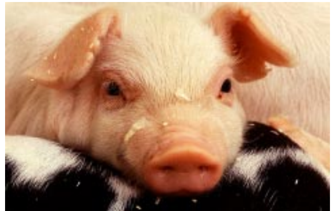
Figure S-5. Baby piglet.