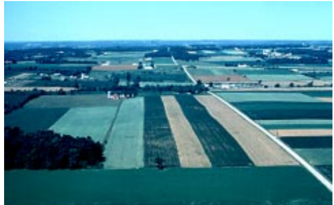
Figure S-2. Aerial photograph of farming community and transportation routes in Ohio.

areas of the nation. Tomorrow's tightly coordinated agriculture may be characterized more by a hub, spoke, and wedge configuration. For example, a large livestock-processing plant at the hub will be in close proximity to livestock-feeding operations (Figure S-1) supplied feed by mills drawing grain and oilseed through transportation (Figure S-2) and communication spokes delineating crop production "wedges" (Figure S-3) covering large areas. The nation's landscape