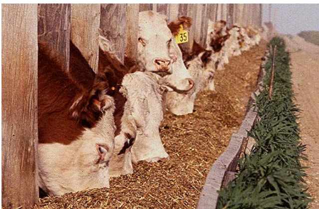
Figure S-1. A livestock feeding operation in the Great Plains.