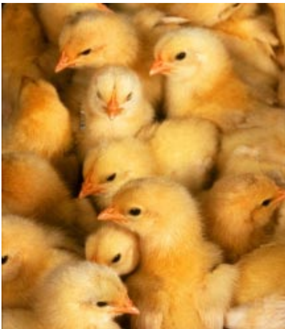
Figure S-6. Baby chicks.

Disadvantages could outweigh advantages of e-commerce for rural farm communities, however. Rural communities have lagged in their access to the broadband fiber optics facilitating e-commerce. While local rural communities with the help of federal and state governments likely will strive to close the rural “digital divide,” at best rural communities will be only catching up with the technology already available to both urban and suburban communities. But information technology will not necessarily help small com-