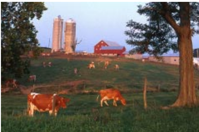
Figure 4.3. A small dairy farm in western Maryland. The U.S. Department of Agriculture defines "small farms" as those averaging $50,000 in gross sales annually—which net, on average, around $23,159.

Understandably, residents of rural communities would like to feel that they have control over their own destinies. By using initiative and by seeking the assistance of the Cooperative Extension Service and other agencies, communities can help shape their own futures (Figure 4.4). Notwithstanding, many rural communities will find