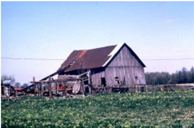
Figure 3.2. Example of abandoned small-farm barn.

The choice facing rural communities seems not to be whether to maintain the status quo or to accept more modern methods of production. Those who elect to maintain the status quo find themselves inevitably losing market share (Figure 3.2). The production contract operations invigorating family farms and local communities in areas like Mercer County, Ohio have detracted from the social and economic vitality