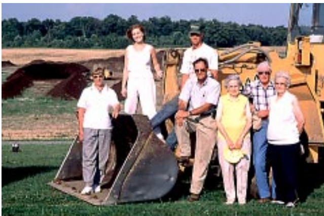
Figure 3.1. Multigenerational family farm operation.

and Green 1999). Household income of the average poultry-farm operator, who was younger and less educated than the average operator and who inhabited a region with fewer economic opportunities, averaged 79% of U.S. household income (Perry, Banker, and Green 1999). Hard evidence is needed with which to analyze whether production contracts detracted from the economic vitality of rural communities by shifting production to other locales.