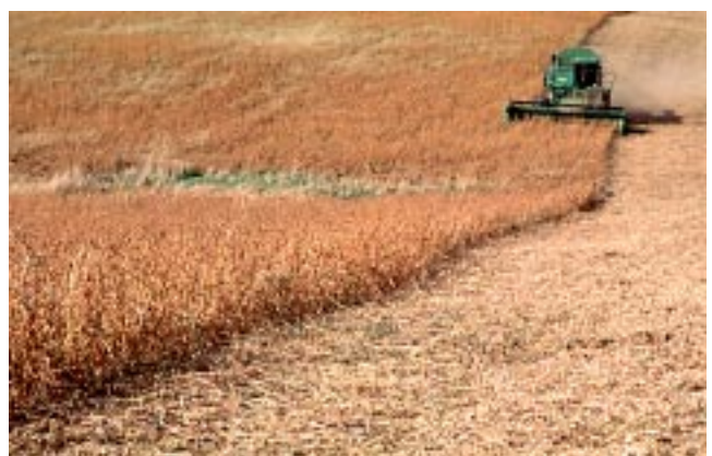
Figure S-3. Soybeans being harvested.